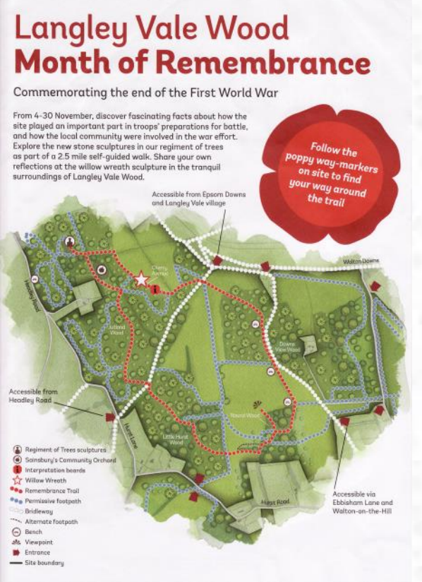
Walks in Langley Vale Wood

The area was the site of Tadworth Training Camp during the Great