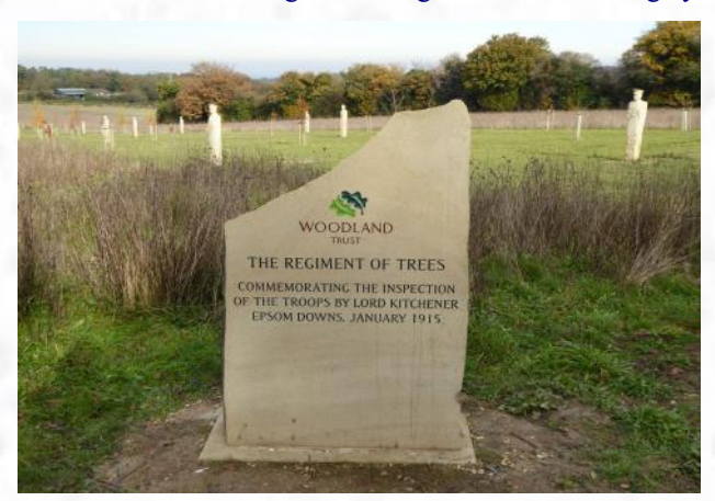
The Memorial Plaque with figures behind

https://www.woodlandtrust.org.uk/visiting-woods/woods/langley-vale-wood/