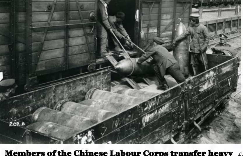
needed 16 trains per day but on 24th Members of the Chinese Labour Corps transfer heavy shells from a standard gauge French covered van into a narrow gauge wagon

planning to open rail routes through Dunkerque into Belgium, and from Calais to Liege and on to Namur in 1919. Immediately after the Armistice work stopped on all lines except the routes through Belgium plus a third one via Courtrai. The line Valenciennes-Mons-Namur-Liege was, therefore, the only line operated to the German frontier plus the lines from Cambrai to Le Cateau, from Lille to Mons, and from Courtrai to Audenarde. Traffic became much more difficult because of the need for civilian, leave, and POW trains, plus the precipitate abandonment of occupied territory (particularly Belgium, where they feared retaliation by the population) by German railway troops. A return to peacetime conditions also saw the re-