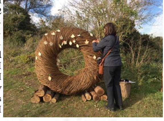
Barbara leaving a dedication on the Poppy Wreath

The main attraction, though is the Regiment of Trees. 12 life-size stone sculptures depicting both civilian and military personnel, to commemorate an inspection by Lord Kitchener in January 1915. I am not a feminist, but I would say that I immediately noticed not one of the figures represented women and I feel that should be corrected. One area, Jutland Wood, is to tell the story of the RN at