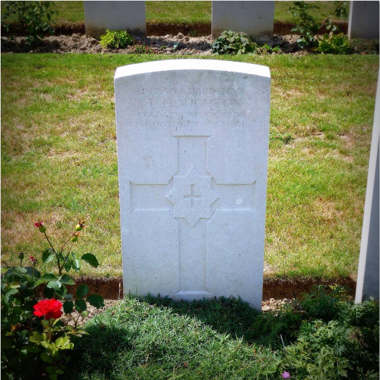
CWGC headstone of Private James Houghton, Dozinghem Military Cemetery, West-Vlaanderen, Belgium.