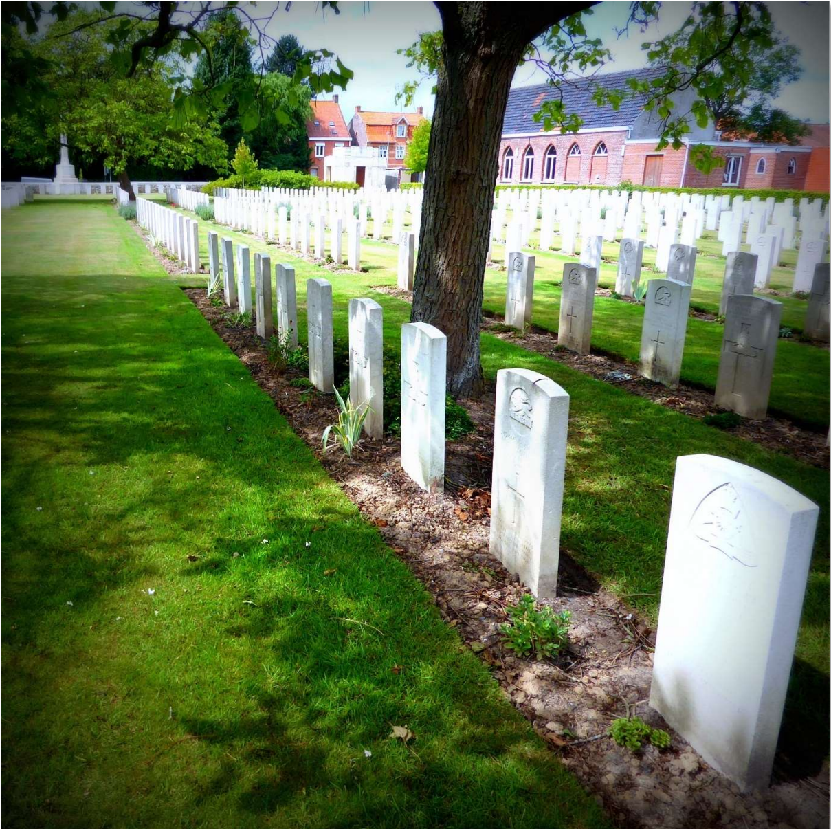
CWGC headstone of Corporal Ernest Kay MM (bottom right), Vlamertinghe Military Cemetery, West-Vlaanderen, Belgium.