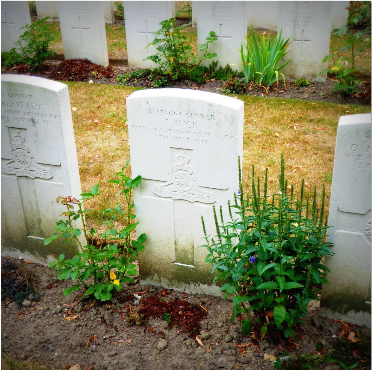
CWGC headstone of Gunner James Buck, Berks Cemetery Extension, Hainaut, Belgium