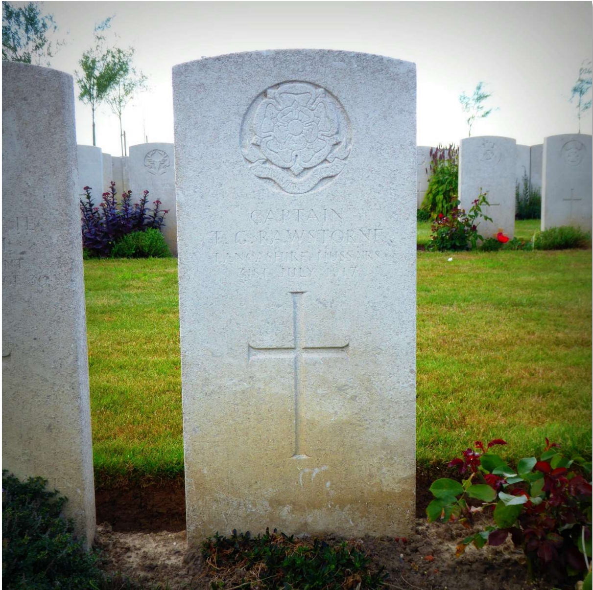
CWGC headstone of Captain Thomas Geoffrey Rawstorne, Bard Cottage Cemetery, West-Vlaanderen, Belgium.