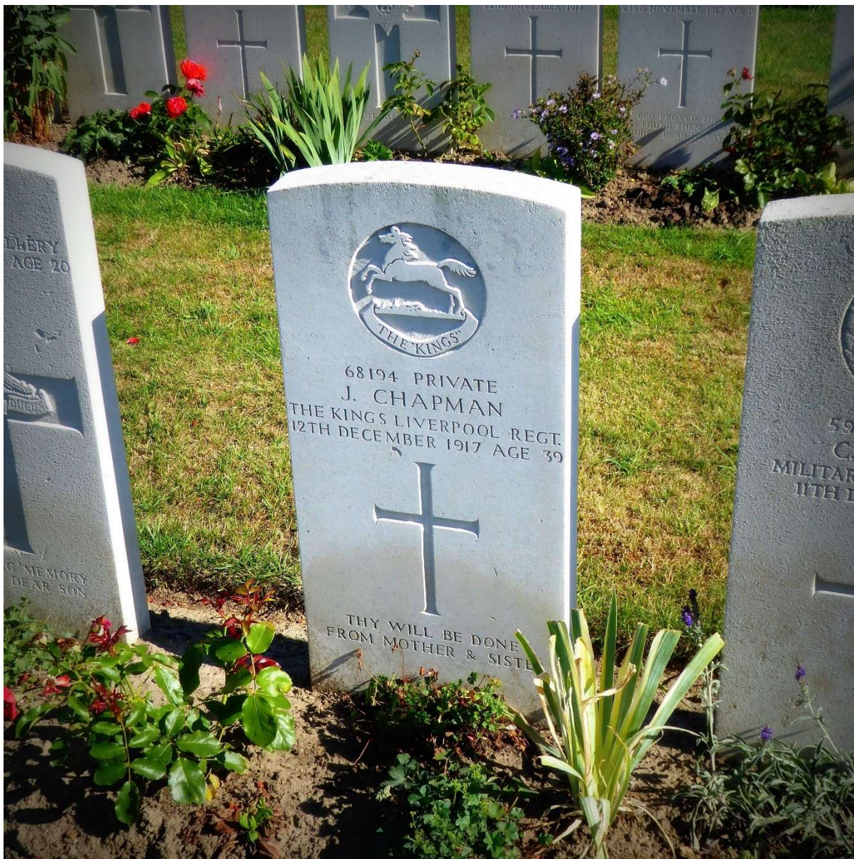
CWGC headstone of Private Jackson Chapman, Duhallow A.D.S. Cemetery, West-Vlaanderen, Belgium