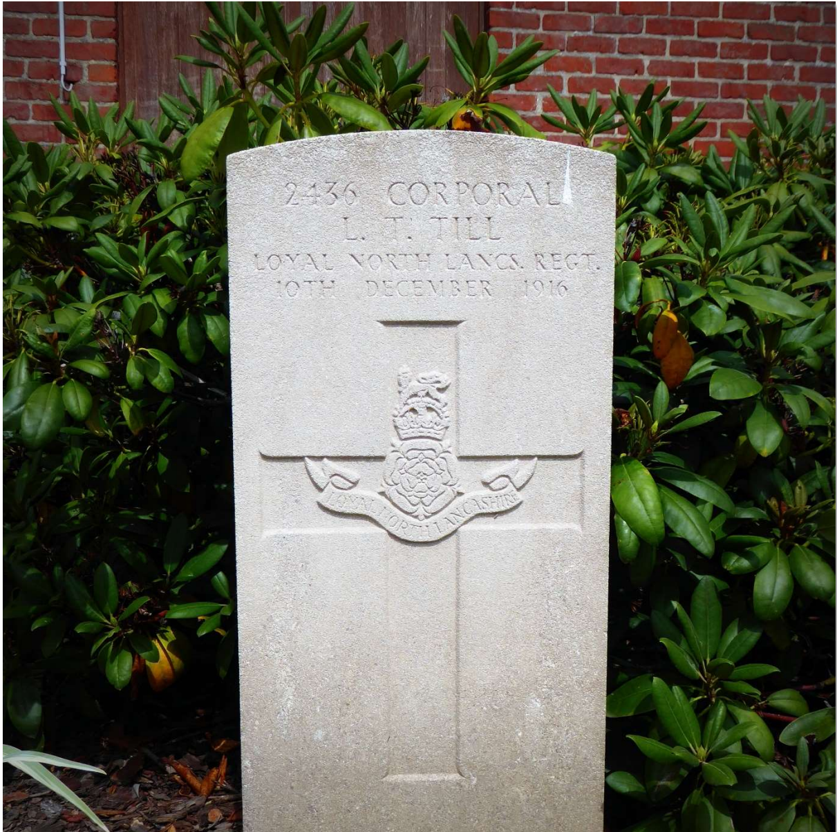
CWGC headstone of Corporal Leonard Thackwell Till, Vlamertinghe Military Cemetery, West-Vlaanderen, Belgium.