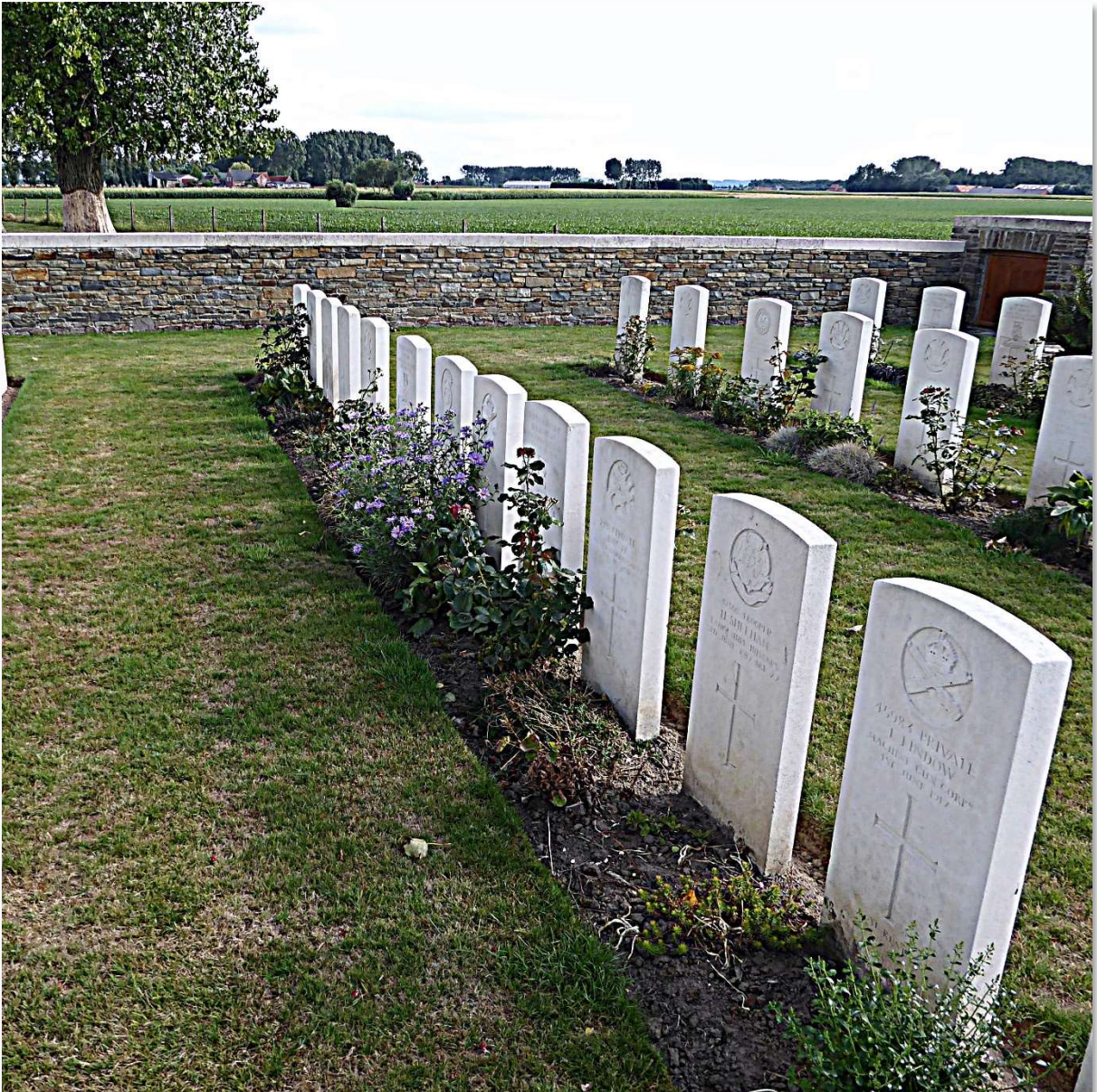
CWGC headstone of Private Thomas Lindow, Ferme-Olivier Cemetery, West-Vlaanderen, Belgium.