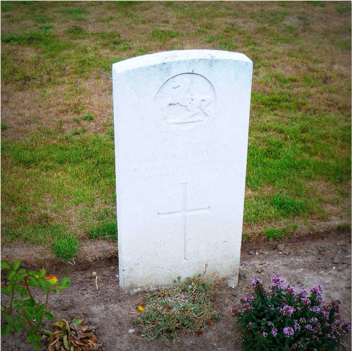
CWGC headstone of Private Roland Edgerton Valentine, Potijze Burial Ground Cemetery, West Vlaanderen, Belgium.