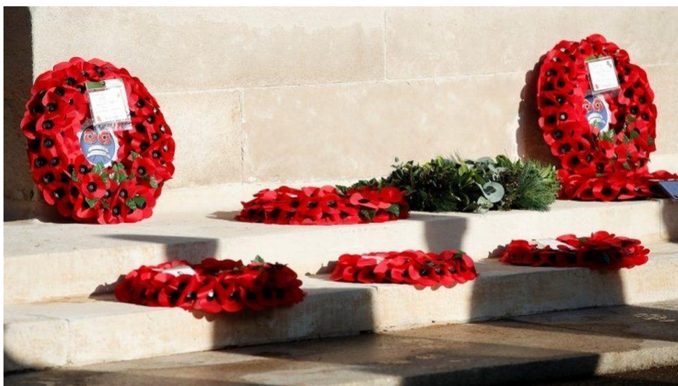
WFA wreaths laid at the Cenotaph, London, 11 th November 2021