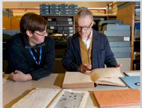
Researching in the RAF Museum archives