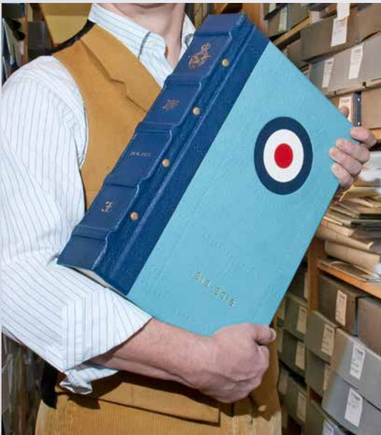
The anthology measures 39 x 27 cm and weighs approximately 7 kgs

The entire edition is limited to just 1500 copies worldwide and books will be allocated on a strictly first come first served basis. Supporters who wish to purchase a copy are urged to do so as soon as possible, as once the subscriber offer closes, copies will be made available to the public at full price.