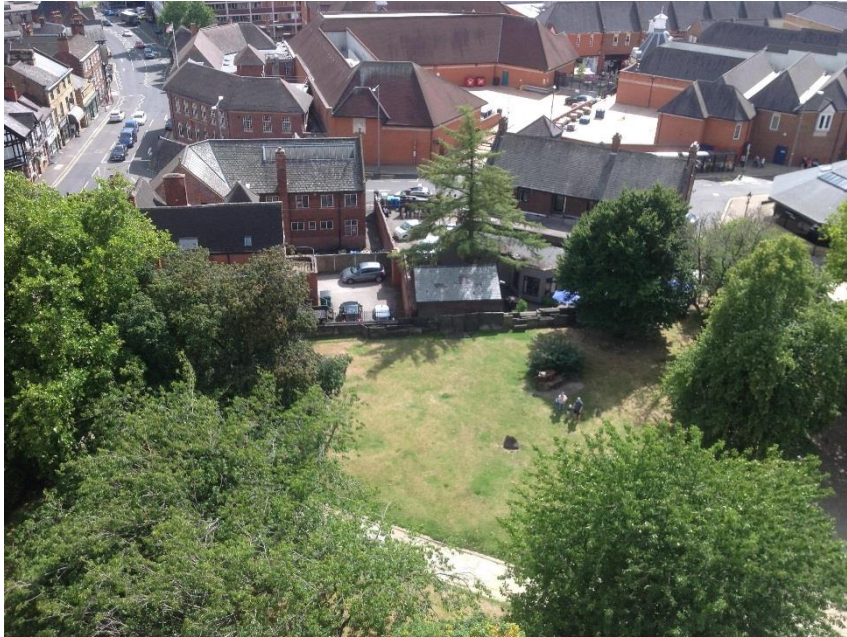
View from the Spire where the giant badge will be laid out